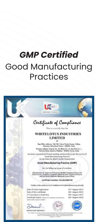
GMP Certified Good Manufacturing Practices