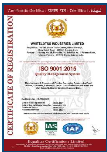
ISO 9001: 2015 Quality Management System