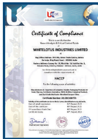
HACCP Compliant Hazard Analysis & Critical Control Points