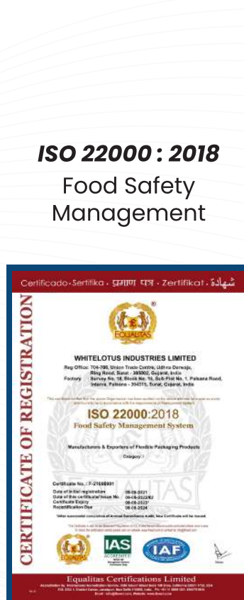
ISO 22000 : 2018 Food Safety Management