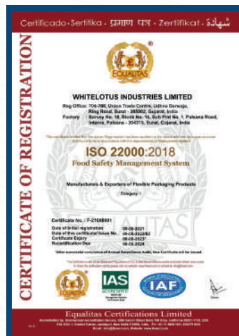
ISO 22000 : 2018 Food Safety Management