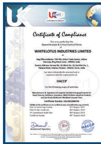
HACCP Compliant Hazard Analysis & Critical Control Points